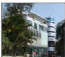
Hunt Partners Bangalore

Our Bangalore operations are now run out of a well appointed office in the newly-constructed Onyx Centre on Museum Road.